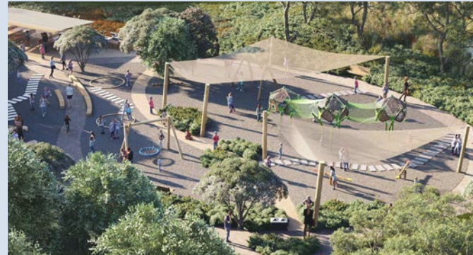
Artist impression of Greenbridge East Park